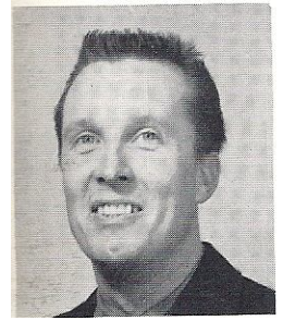
AHS faculty - 1959

I taught the 6th grade at San Dimas Elementary for 1 1/2 years (1956-1957) and then at Azusa High for two years (1957-1959). I moved to Duarte High School where I taught history and continued to coach. I left Duarte in 1965 and worked as a school psychologist until 1972. Then I made the big move to Oklahoma City where I taught education and psychology courses at the University of Central Oklahoma until my retirement in 2000. I graduated from L.A. State (Cal State L.A.) in 1956 with a major in history and minor in physical education. I graduated with a Master's Degree from Pasadena Nazarene College in 1965 and went on to earn a doctorate at the University of Tulsa in 1973. Since 2000 I have pursued a limited practice in psychology and enjoy working at a few schools and assisting lawyers.