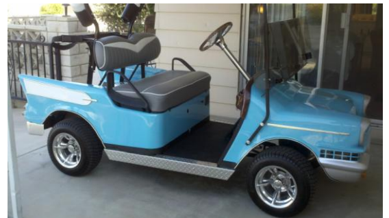
Cheryl's “cute” '57 Chevy golf car