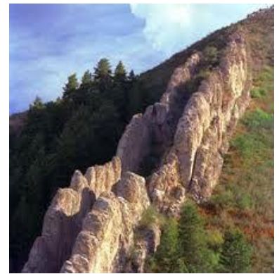
Devil's Slide rock formation