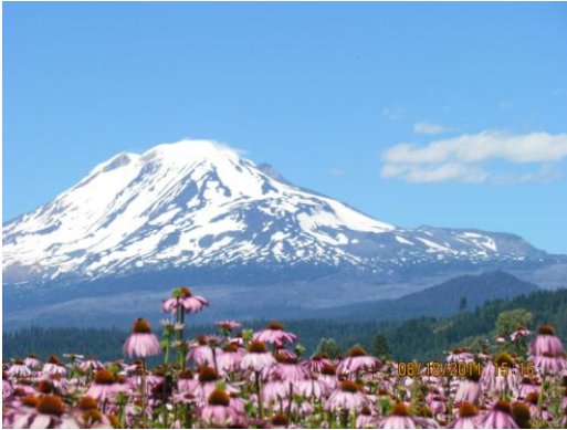
Echinacea and Mount Adams

huckleberry pie. They bought “melt-in-your-mouth” cheeses at Cascadia Creamery, stopped by the Pendleton Mills and watched windsurfing in Hood River.