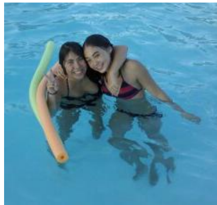
Opal & Violet – Palm Desert, CA