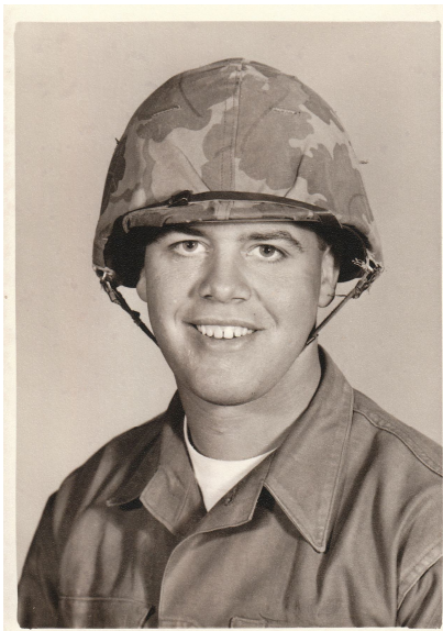
1962 – PFC Infantry Training