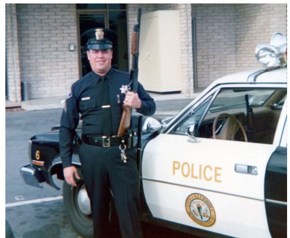
1984 – Glendora Police Department

For a while I worked with the Southern Pacific Railroad as a brakeman and then enrolled at Pasadena City College where I studied Police Sciences. Upon graduation I was hired by the City of Glendora and sworn in as an Officer on April 2nd, 1969. I later attended and graduated from the L.A. County Sheriff's Academy and was assigned to the Patrol Division where I worked as a patrolman for a couple of years.