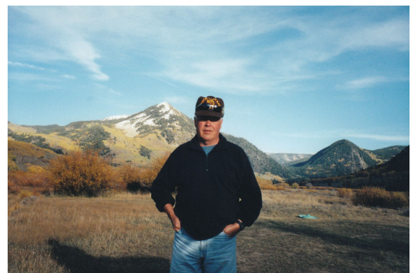
2003 – Green River fishing trip

You can read this bio and all previous alumni bios at http://www.azusahighschool1961.com/Pages/bios.html