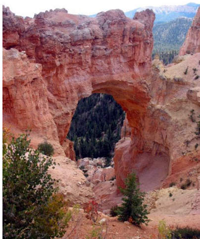
Bryce Canyon, Utah