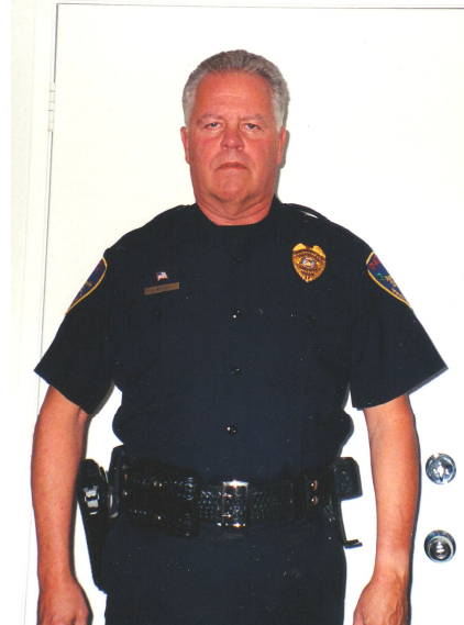
2002 – Rancho Santa Fe Security

I was later employed by the Rancho Santa Fe Association, along with nine other officers, to patrol and maintain security for one of the wealthiest communities in the U.S. Our department was charged with protecting the residents who were mostly comprised of celebrities, sports figures and notable political personalities. My security career recently ended on April 18th, 2009 when I elected to retire from the Association.