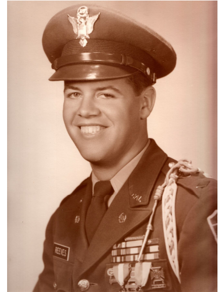
1961 – California Cadet Corps.

In my freshman year I began at the rank of Cadet. Four years later I graduated from Azusa's 146th Battalion as its Battalion Commander with rank of Senior Lt. Colonel in the State of California by order of the Governor. My experience in the Cadet Corps set the stage for active service in the U.S. Marine Corps and a future career in law enforcement.