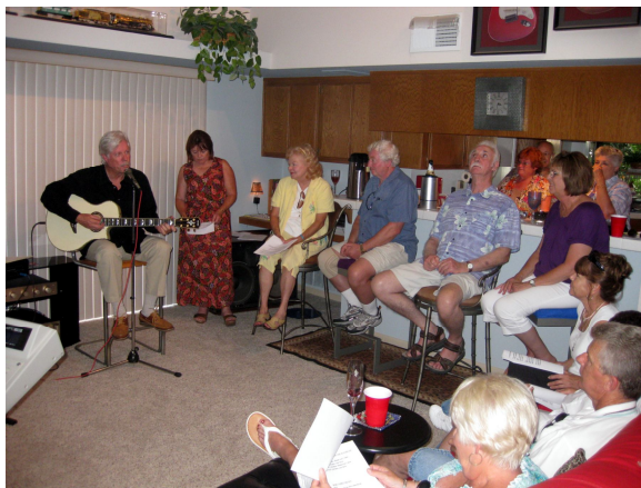
Kiowa Reunion Committee