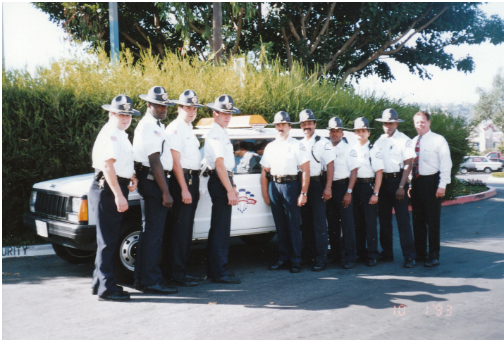
1997 – Carlsbad Mall Security

In 1979 I left Law Enforcement as it became too much for the family to handle, and I pursued a career in the related field of Industrial Security. At first I worked as a security agent for a large market chain and then entered the field of Private Investigation in San Diego for a while. In 1989 I accepted a job in Mall Security at large regional mall in Escondido where I eventually became the Asst. Security Director. In 1991 I was promoted to Security Director and was transferred to a large regional mall in Carlsbad, California The next few years proved to be a great experience for me and I enjoyed it immensely. Needless to say I am very proud of my accomplishments during my tenure.