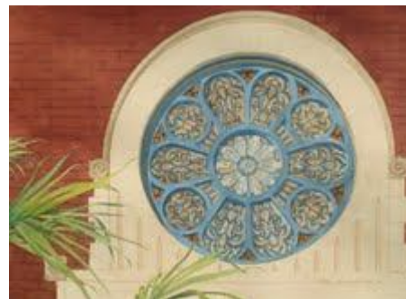
Rose Window, Smiley Library