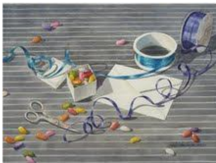
And a Box Full of Beans