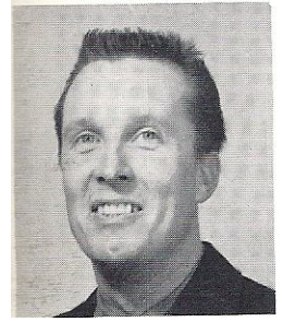
AHS faculty - 1959

I taught the 6th grade at San Dimas Elementary for 1 1/2 years (1956-1957) and then at Azusa High for two years (1957-1959). I moved to Duarte High School where I taught history and continued to coach. I left Duarte in 1965 and worked as a school psychologist until 1972. Then I made the big move to Oklahoma City where I taught education and psychology courses at the University of Central Oklahoma until my retirement in 2000. I graduated from L.A. State (Cal State L.A.) in 1956 with a major in history and minor in physical education. I graduated with a Master's Degree from Pasadena Nazarene College in 1965 and went on to earn a doctorate at the University of Tulsa in 1973. Since 2000 I have pursued a limited practice in psychology and enjoy working at a few schools and assisting lawyers.