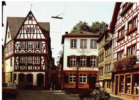
Town Square in Mainz

Here is a picture of one of the town squares in Mainz – a grand example.